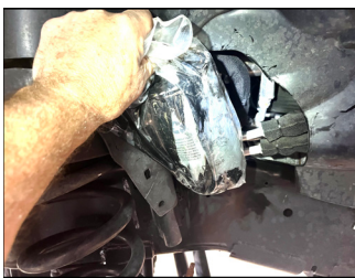
Wow, if you bag it there will not be a mess to have to clean up!

With the opening cut-to-size, don't forget this BAG IT! tip: Put a zip-loc bag around the oil filter just before the final turn to unthread the filter from the oil tube.