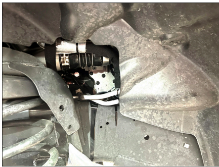
Really? An opening too small for the average mechanic/DIY guy.

The solution is to cut the plastic wheel well and make the opening larger.