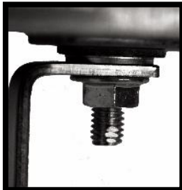
In the photo to the left, you can see that Ram has machined a flat spot onto the threads to help prevent it falling off. (This view is from the underside of the intake plenum).