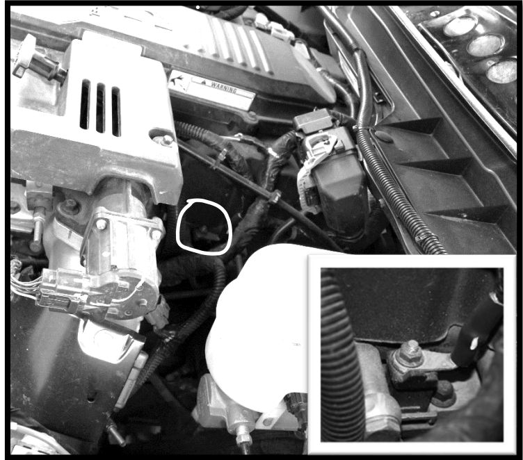
Above: Location of stud shown (circled) under the hood. Detail of nut in the inset.