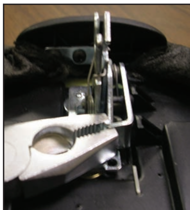
Bend with pliers