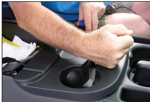
Reattach the cover and you are finished with the installation of the 'Double Cup' cup holder.