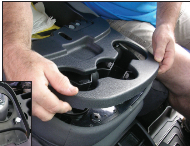
Removing plastic cover.