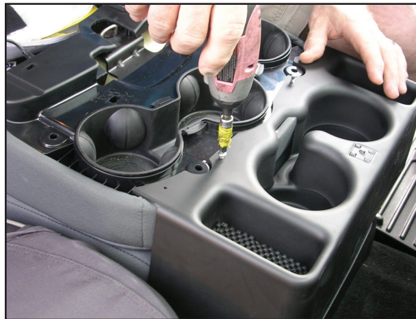
Test fit the cup holder and then screw the self-tapping phillips head screws into place.