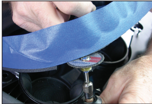
Then cut the edge with a Dremel tool.