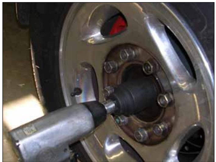
My old Chicago Pneumatic 1/2" impact wrench having a go with a 3/4" socket adapter and 1 11/16" socket. Both nuts are standard clockwise tighten so remember patience and penetrating oil. My impact wrench took about 20 seconds per side and the nuts were off.

Before you put the truck up on the four jack stands, remove the hub caps and take the half shaft hub nuts off. This requires first removing the cotter pins and then a 1 11/16" socket. Penetrating oil and patience are important components for this phase of the project. In my experience the best penetrating oil you can get is mixture of 50% acetone and 50% automatic transmission fluid. One word of caution is that the penetrating oil isn't friendly to the clear coat on your aluminum wheels, so caution with runoff is necessary. However, repeated application of penetrating oil over a week's time prior to disassembly will make the job go much easier, especially with the bearing hubs.