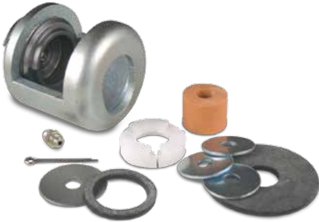
The Luke's Link replacement ball stud parts.

So what is the solution? Luke's Link of Colorado offers a permanent solution to Dodge pickup tracking problems. At Luke's Link our line (technically speaking, a ball stud socket collar) was designed to rebuild and convert track bars to a fully adjustable end. With this kit, you remove the ball stud and internal parts and slide a cap or C-clamp over the end. You then install the new modified internal parts with the new modified spring being the main component. Then a large plug screws into the cap to tighten everything down. With this setup, the ball joint will never wear out. If it does, you can adjust it by unscrewing the plug and putting a spacer under the plug to shim the spring down. This only takes a few minutes to adjust. This allows the track bar assembly to last for the life of the truck.