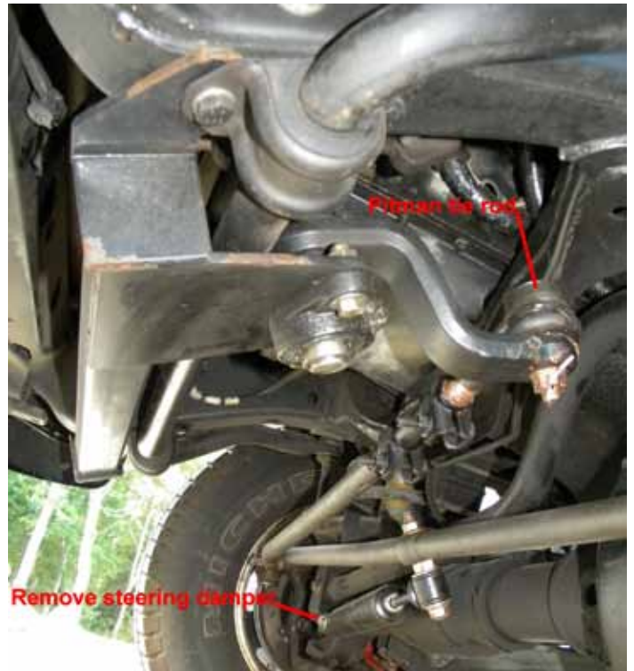
Remove steering damper.

With the brake rotors off both sides, this is a great time to break this project down into two projects: tie rod ends and ball joints.