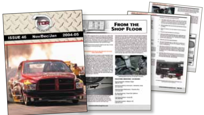
The Issue 46 article (pages 154-156) has the details of the SSI bracket with the Mopar track bar.

For the Death Wobble problem on a Second Generation truck, I wrote an article in Issue 46 (November 2004) that covered the installation of a truck bar relocation bracket and a new Mopar '03-'08 track bar. Since the editor sent this article to me for my review, I went back seven years to Issue 46 to see if my opinion had changed. It has not. As I mentioned, the repair is more involved than the simple rebuild of the track bar with a Luke's Link. The parts used back then were a track bar relocation bracket from Solid Steel Industries ( www.solidsteel.biz , part number DSS0019402-4, $209) Mopar '03-'08 track bar (part number 52106795AC, at about $250). I still use these parts. Since 2004 other companies have introduced different versions of this kit; specifically, the folks at BD Power offer a bracket and track bar kit (BD part number 1032011, $480). My experience with the BD kit is that it is more difficult to install.