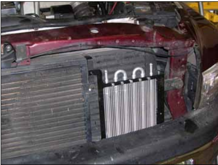
An automatic transmission fluid cooler in its new job as a power steering fluid cooler.

One problem became readily apparent when I removed the power steering hydraulic hoses. My power steering fluid smelled burned and was unnaturally dark in color. I then decided to take the power steering pump off and check the condition of the pump. This observation fit with the extremely high temperature of the hose fittings near the hydraulic brake assist unit I have observed over the life of the truck. I decided to do something about high temperature of the power steering fluid. So I found an automatic transmission fluid cooler that would fit on the driver's side of the air conditioning condenser in front of the intercooler. I designed a bracket and mounted the cooler in line in the return hose from the steering gear box back to the power steering pump reservoir.