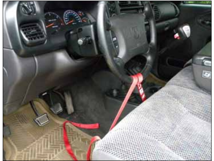
This technique makes the steering stay put while you work which avoids clock spring damage.

To fix one of these issues I decided to replace the bearing in the bottom of the steering column with the bushing offered by http://rocksolidramtrucksteering.com . The instructions supplied with the kit were very straightforward and it appears to be somewhat easier to do on my truck given it is a manual rather than the automatic trucks with the column gear selector. One note worth mentioning here is that any time you uncouple the steering system, the steering wheel is free to turn inside the cab. This must not be allowed to happen as it may bring about the destruction of the “clock spring” inside the column. The clock spring is actually a thin ribbon cable type electrical connection between the portion of the column that rotates and the part that doesn’t rotate. The catch here is that the cable or clock spring is a fixed length so if you connect the steering back up in a different orientation than it currently is, you may run out of cable when turning left or right. The best way to avoid this is to put the truck’s front wheels straight ahead prior to disassembly. Then take a cargo strap and attach it to one of the driver’s seat floor supports, thread it through the steering wheel and connect to the other seat support as shown below: