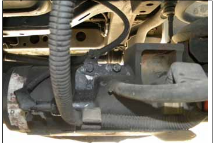
Spline engagement housing on back side of front axle.

Once removed simply put the collar on the intermediate shaft while reinstalling the passenger side half shaft. Then position the collar on the spline so that the actuator fork engages the collar and you can bolt up the actuator/housing cover. I recommend removing the spline engagement housing cover anyway to wipe the old differential lube and crud out of the sump.