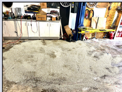
Kitty litter, two 25-pound bags and another $10.

A six-pack of beer and two 25-pound bags of kitty litter.