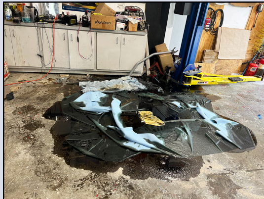
Do you see a $100 bill on the floor?

The installation dude moved the oil valve to the "open" position. He failed to close the valve. The result, 3 gallons of lube oil (synthetic at $33/gallon) to be cleaned up.