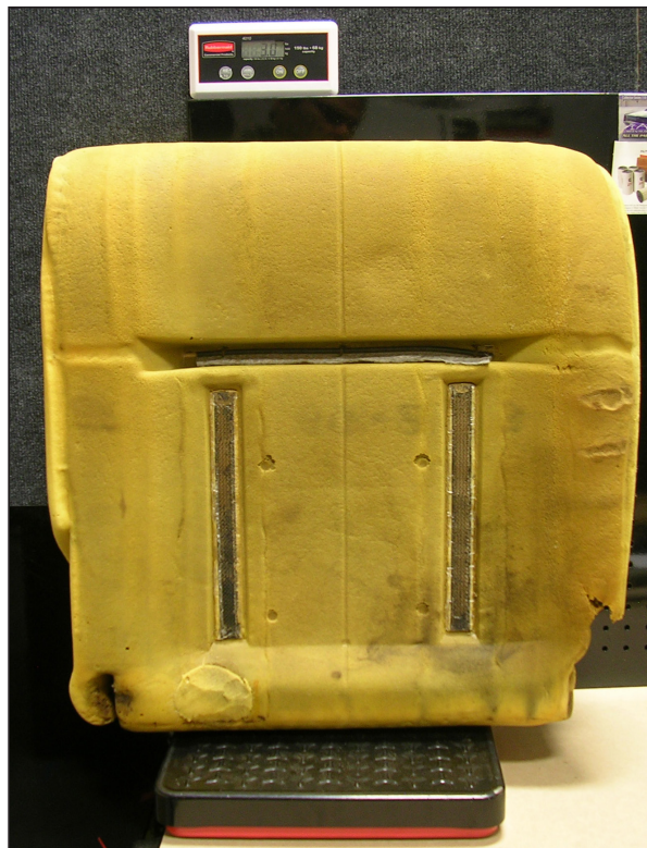
Mopar cushion weight is 3 lbs.

We expect you'll note the big difference in the weight/heft of our seat cushion versus the Mopar part.