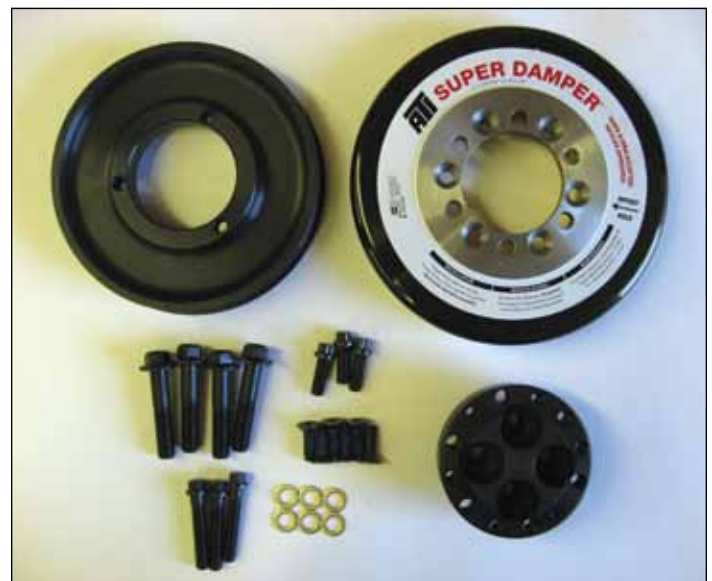
The ATI Super Damper is supplied in three parts: the damper itself, the vehicle-specific hub, and the aluminum pulley. All necessary bolts and screws are supplied to assemble this damper, but it cannot be assembled before installation on the engine, due to the fact that the installation bolts do not fit through the crankshaft flange holes after it is assembled.

There are a few companies making what are essentially the stock-style dampers, but if you want an improvement over stock, there are really only two choices that offer a high-performance model. Both of the following aftermarket dampers have what I feel is a definite advantage over the stock damper besides just better performance. The serpentine belt pulley is machined as part of the hub, and as such is driven directly by the engine, not by the transfer of power through rubber as in the stock design. This means that the pulley cannot become misaligned, even if the damping function were to fail or lessen in effectiveness. Nothing will ever be thrown off the crank from deterioration of a rubber part. Keep in mind that the prices I used below are list prices, street pricing is considerably less. Also, prices shown are for my 2001; other year models may vary slightly.