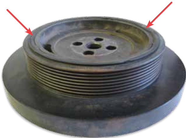
The pulley side of the stock damper shows the bonded rubber ring squeezing out from the gap between the hub and the inertia ring. The Service Manual clearly states that any protrusion beyond the face of the ring other than a slight convexity requires the replacement of the damper, as this indicates the beginning of the failure of the rubber.

physical shape. You can try this experiment to better understand the principles of native frequency and vibration. The next time you are standing on a single-span pedestrian bridge, such as one spanning a creek, stand in the middle of it and bounce up and down. You will feel its natural frequency as it shakes. If you time your bounces just right, and in cadence with and emphasizing this natural frequency, you can get the bridge moving up and down a surprising amount, much more so than if you were just walking across it. I am always astonished at how violently the bridge will shudder up and down if I continue this motion at just the right timing. Now imagine that in the center of this bouncing bridge you also have a 55-gallon drum filled with heavy gear-oil. Inside the drum and hanging suspended on a spring is a large, heavy steel washer that is allowed to move independently of the drum, which moves with the bridge. Now when you bounce on the bridge your motion is countered and dampened by the resistance of the weight moving against the oil. This is precisely what the engine damper on our truck is designed to do. The damper takes these short-duration shocks and absorbs them, thereby reducing the transmitted vibrations. The result is not only less stress and wear but also more usable power and a more stable valve train operation.