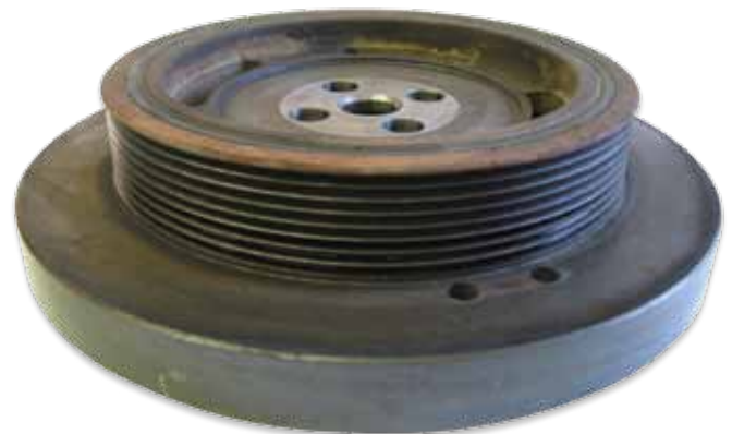
This shows the stock damper in good usable condition. Notice the rubber ring compared to the previous picture, and how it is flush with the hub and inertia ring.

Starting in 2007.5 with the 6.7 engines Cummins changed the damper design, foregoing the rubber in favor of a viscous-damped type. This damper works by enclosing an inertia ring inside a housing that contains a thick silicone fluid. This allows the damper to be more effective at a much wider RPM range than the tuned-rubber type used on the earlier trucks. Because the inertia ring is now floating in a thick viscous fluid rather than being a bonded mechanical connection, it offers a variable resistance to the firing impulses and therefore is better suited to countering them and canceling vibrations. I'll talk more about this type when discussing the aftermarket dampers. These newer dampers do not require any periodic inspection, so the rest of this article applies primarily to 5.9-liter equipped trucks.