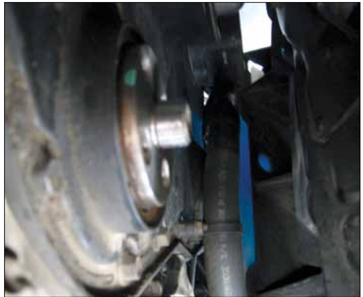
The damper is hub-centric and is aligned on the extension that is machined on the end of the crank. It is important when installing whichever damper you use, to use anti-seize or grease on this hub when fitting the new damper so as not to gall this close-fitting surface when turning the hub for bolt alignment.

The first thing you will notice about these dampers is the weight. Mass is critical to being effective. A small, lightweight damper will not do much regardless of what method it uses to quell the vibrations, which work against this mass. You need the weight to counter the input energy. My stock damper weighs 14 pounds. The ATI tipped the scales at 18 pounds, a 4 pound increase over stock. The Fluidampr weighed-in at 24 pounds, a full 10 pounds heavier than the stock unit. Aftermarket dampers for First, Third, and Fourth-generation trucks vary slightly in weight from these, but all are substantially heavier than stock.