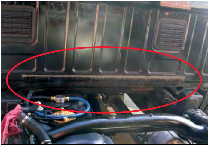
The abrasion at the cab.