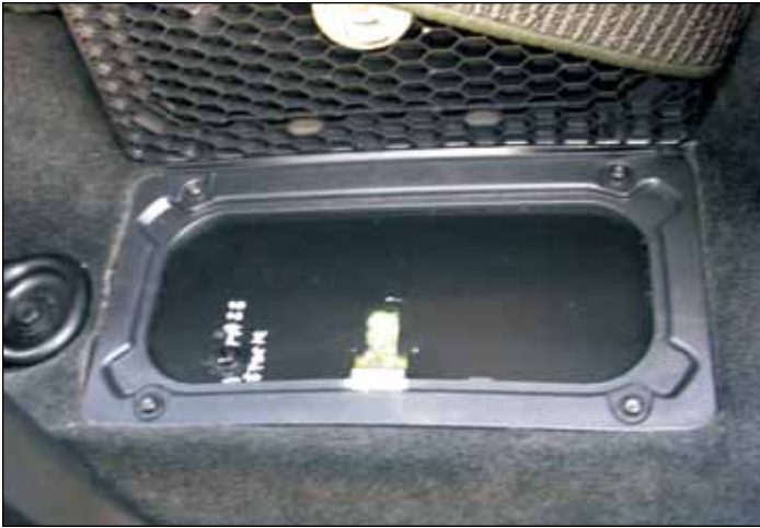
Open the driver's side rear floor compartment and you can see my FASS switch panel.