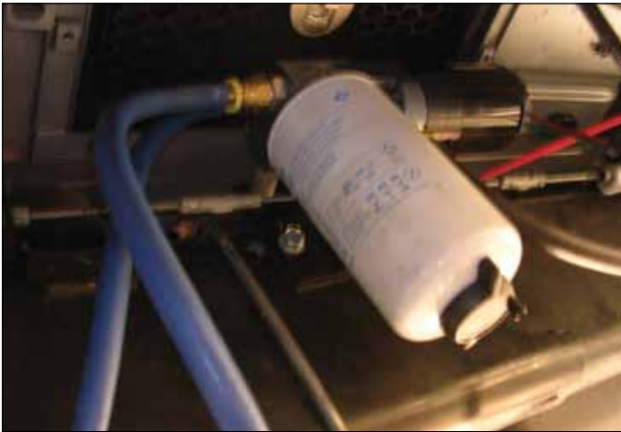
The FASS unit from the underside.