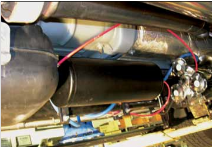
The inside of the driver's side frame rail holds an air tank and air horns.