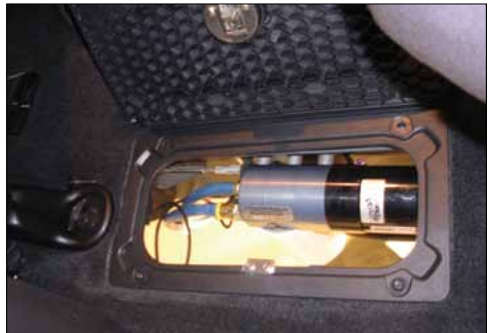
From above, a picture of the FASS unit that I installed on the outside of the driver's side frame rail.