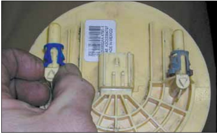
The pesky "pinch-in" clips that hold the fuel lines to the fuel pump assembly.