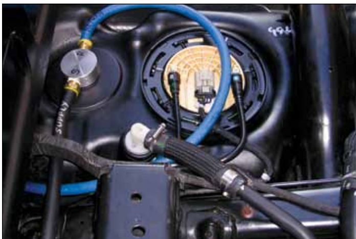
From this photo (yes, the bed was really removed) you can see how it all goes together.