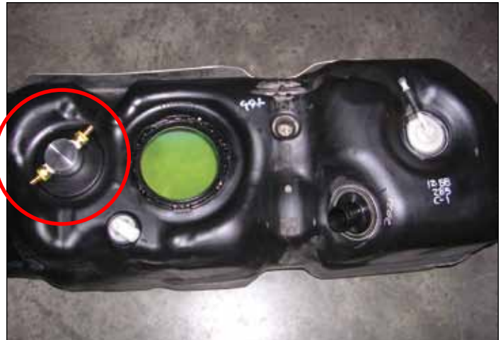
Here is a picture of the tank that has been removed from the truck. Look to the front and you can see the location of the new FASS drawstraw.