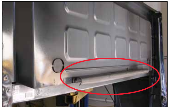
The truck's plastic bed snubber.