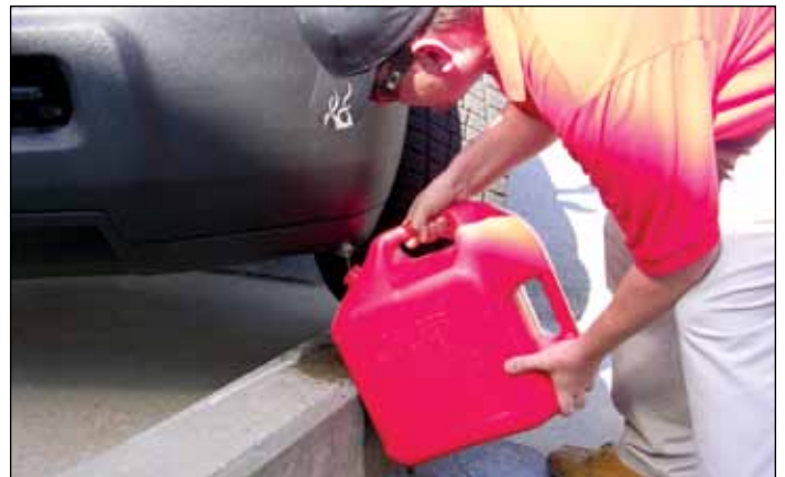
Utilizing the fuel drain line extension tip from Issue 75 it is easy to drain the fuel tank.

Oops, turning the pump on solves only half of the problem. Where do you disconnect the fuel supply line? (This is a trick question.) Answer: don't over think this one. Simply open the fuel drain petcock at the fuel filter. And, if you've previously taken five minutes to extend the fuel drain line (see Issue 75, page 80) and the fuel will drain directly into a five-gallon jug(s).