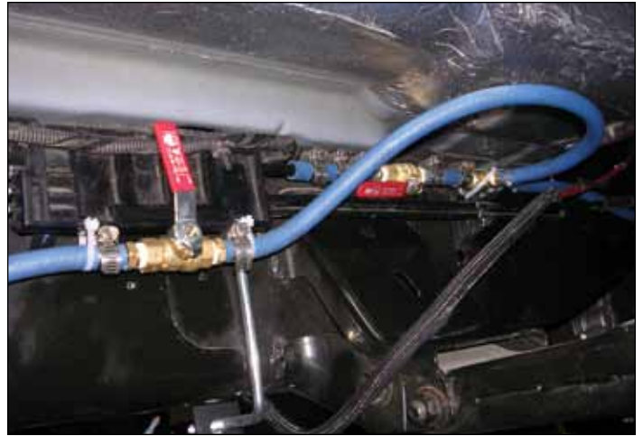
Stock valve is open, FASS valve is closed.