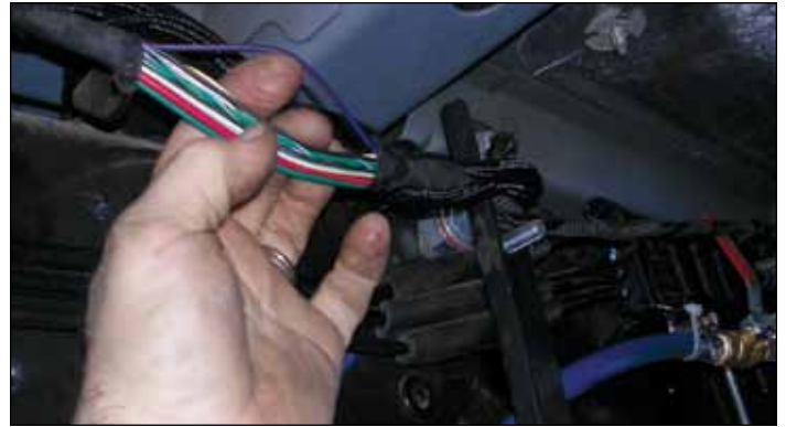
Intercept the wiring harness at the area of the driver's door and you can manually operate the fuel transfer pump.

Here's how: With my 2010 truck I learned that the 12-volt positive wire to the fuel transfer pump is blue with a red stripe. From underneath the truck intercept the wiring harness at the driver's door area, slice into the cover and locate the blue/red power wire. With a long wire fastened to battery positive you can crimp wires and turn the fuel pump on to drain the tank.