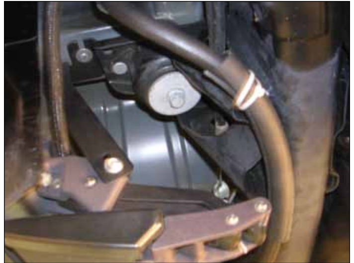
Heater hose for fuel line protection.