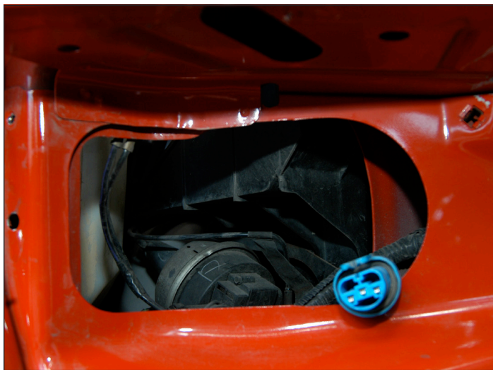
The light pocket in my '98 Turbo Diesel already has the cut out needed to install the Sport lights.

The installation can be a straight drop in or may require a little sheet metal trimming, depending on the build date of your Turbo Diesel. My '98 truck was a late build, so the factory cutout for the quad lights had already been incorporated. For Piers, his '97 was the same as my previous '98, 2Timer, and required the sheet metal trim. If your Turbo Diesel looks like this you will not need to trim.