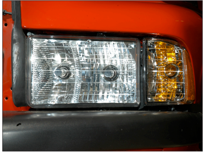
Installed, the Sport lamps not only look awesome but provide about double the lighting with coverage both far and wide.

Installed, they not only look cool, but the lighting is far superior to the original configuration. Don't forget; adjust the quad lamps for proper placement on the road. There is nothing worse than blinding an oncoming driver with improperly adjusted lamps.