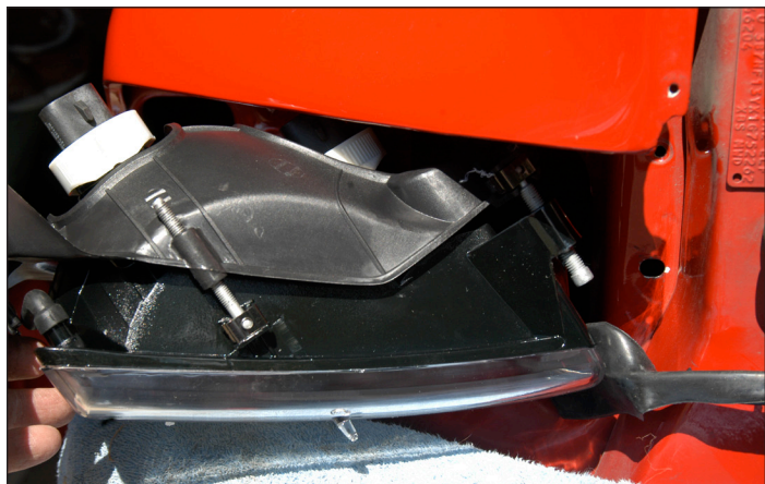
Cover the bumper with a clean shop towel, place the new Sport lamp face down, then rotate the lamp up and back into position.

The new quad lamp assembly installs using the reverse procedure to the removal of the old assembly; towel in place, lens facing down on top of the bumper cover and rotate in place. There will be enough space to connect the lamps to the harness once they are sitting in the well before you install the three screws to hold the assembly in place.