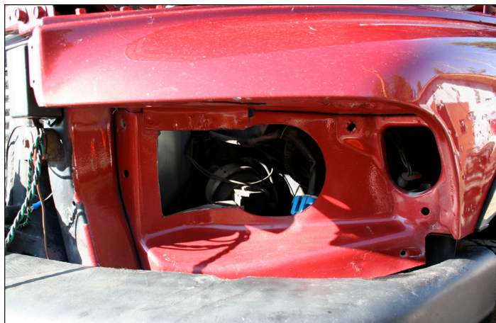
Our Canadian Turbo Diesel was not so fortunate and needed to have the cut out made to accommodate the Sport lamps. A Sawzall works well. Be careful not to cut out the ground lug. Be sure to paint the cut edge to prevent rust.

The reason for the larger cutout is to accommodate the dual lamp sockets found on the quad light. If you need to trim, a Sawzall with a metal blade will do the trick, just be careful not to cut the ground lug found at the top of the existing headlight opening, and remember to paint the freshly cut metal to prevent future rust. Here is the Canadian Turbo Diesel with the sheet metal trim completed.