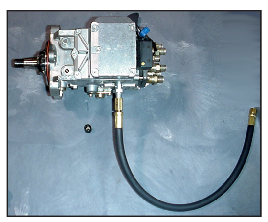
VP-44 Fuel Pump with Fuel Hose attached.