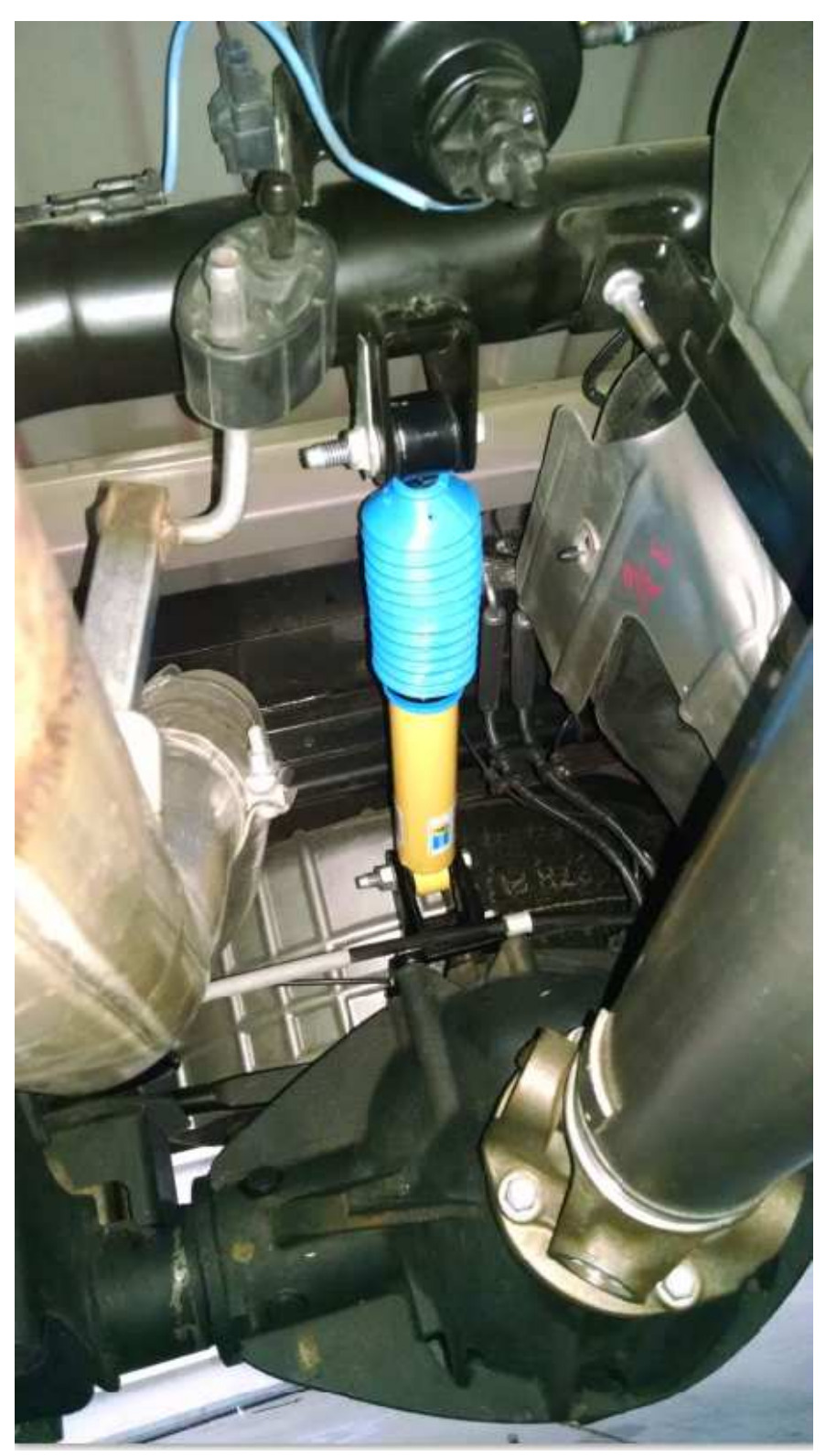
Note: The shocks depicted herein may differ slightly in appearance from the supplied components.