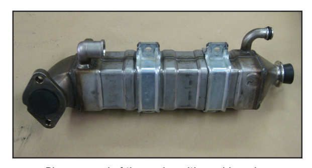
Plug one end of the cooler with a rubber plug and fill with hot water and cleaning solution. Plug the other end and soak overnight.

Now that the cooler has been removed it is time for the overnight soak. To save cleaning solution and the associated messy waste, we have supplied two rubber plugs that fit into the cooler openings. Plug the cooler at both ends; fill it up the solution and hot water; shake it like you would a paint can; and allow it to sit overnight.