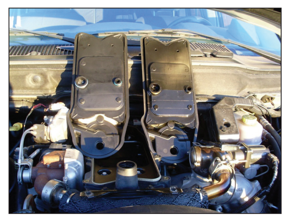
New CCV filter on the left. At 30,000 miles the CCV filter on the right looked clean and was reinstalled.