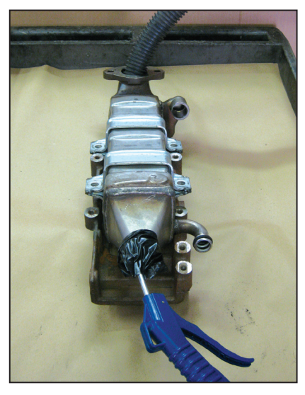
With carefully regulated compressed air you can blow carbon into the inlet hose of a vacuum cleaner.

Several diesel truck repair shops we've talked to suggested that you start the EGR cooler cleaning process by blowing the carbon out of the EGR cooler with regulated compressed air. Start at 10psi and increase the pressure as the dust flys—and the dust will fly. Your blowing out of the EGR cooler should be done in the wide open spaces or, better yet, blow the dust into an old shop vacuum that you no longer care about.