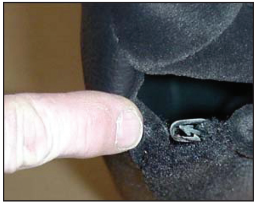
The seat cover J-Clips.

Next, unlatch the J-Clips that attach the seat back cover together.