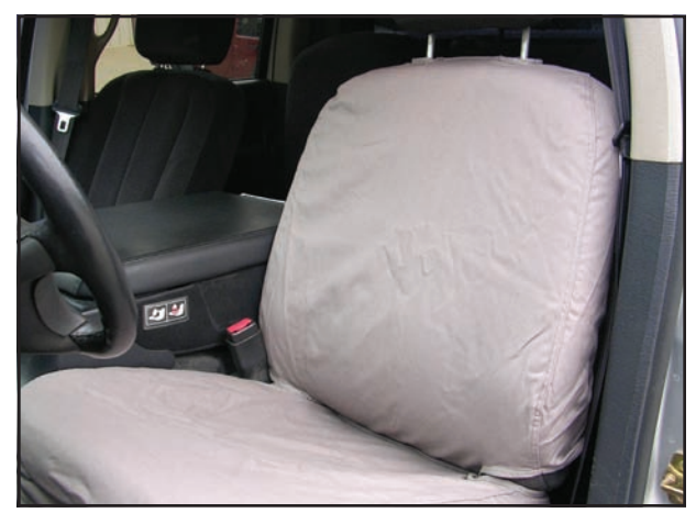
Seat cover installed over the heater elements on the back and bottom of the seat.

Next, make a trip to the local Auto Boys/Pep Zone (or mail order for a matching fit) and purchase some accessory seat covers.