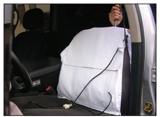
T-shirt, heater element for the seat back.

First, find a scrap t-shirt. Attach the heater elements to the t-shirt. Drape the t-shirt over your existing seats using the head rest holes to keep the t-shirt in place on the seat back and a good tuck-fit to keep the t-shirt in place on the front of the seat bottom.