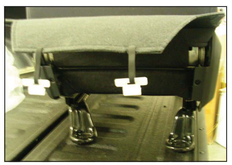
Note the elastic seat clips.

To remove the seat back cover, you start by removing the two elastic seat clips that keep the bottom flap of the cover in place.