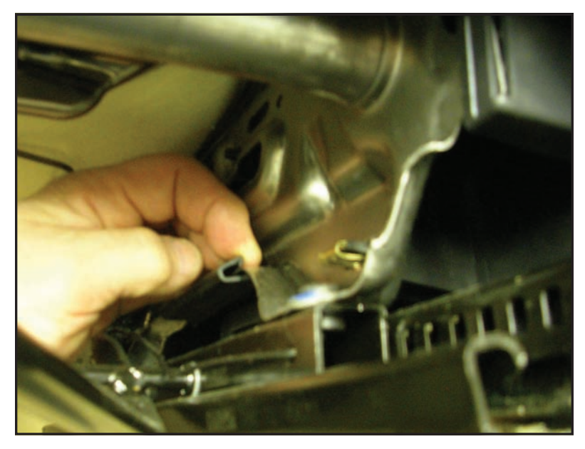
Remove the seat cover by pushing the J-Clip away from the metal edge of the seat's bottom.

Removal is the same as the '94-'09 seat covers—there are J-Clips along each side of the cover. However, you do not need to release all four sides of the cover, only the front J-Clip and the next-to-console side J-Clip.