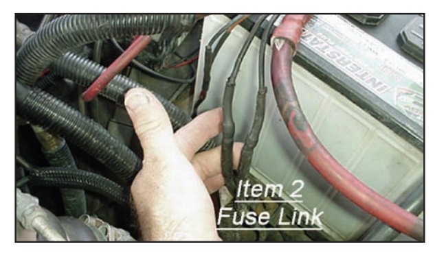
Also check the fuseable link that feeds the solenoid (Item 2) or fuse #9 in the fuse panel.

If voltage is present for "START" the solenoid is likely the problem.