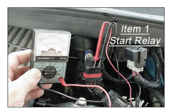
No voltage for "START" tells you to check the relay to the solenoid (Item 1).

Do a voltage check at the solenoid's three-wire connector. Negative goes to the Black/Red trace wire. On "START", positive 12-volts will be at the Red/Black trace wire. (Item 1.)