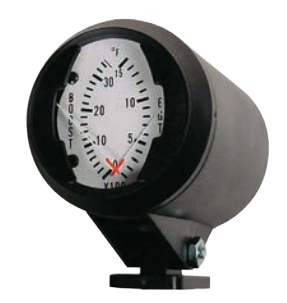
Universal Gauge "Bullet" mount (PN: <u>GM-1BULLET</u>) Can be mounted anywhere on dash.