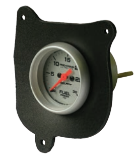
Single A-Pillar mount (PN: GM-DG-01FACE-9902) Mounts in bezel storage compartment.