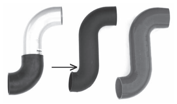
aFe steel/rubber Torque Tube (Left), aFe plastic Torque Booster tube (Middle), DPP silicone rubber Cool Tube (Right). Note tight bend in plastic tube (arrow) which increases air flow restriction

Will replacing the stock intake tube with an aftermarket tube produce more power? All three aftermarket intake tubes tested did improve horsepower, torque and turbo boost response over the stock intake with or without the silencer installed. Are the slight improvements worth the money? You be the judge. As a rule, the tubes with the larger inside diameter and bend radius will have less airflow resistance and provide slight improvement in power. The tubes with the largest inside diameter and bend radius were the DPP "Cool Tube" and aFe steel "Torque Tube." Consequently, these two tubes made slightly more power than the aFe plastic tube. See Tests 22, 23 and 24. Our testing shows that inside tube diameters that are larger than four inches have no power gain on engines that produce less than 400 rear wheel horsepower.