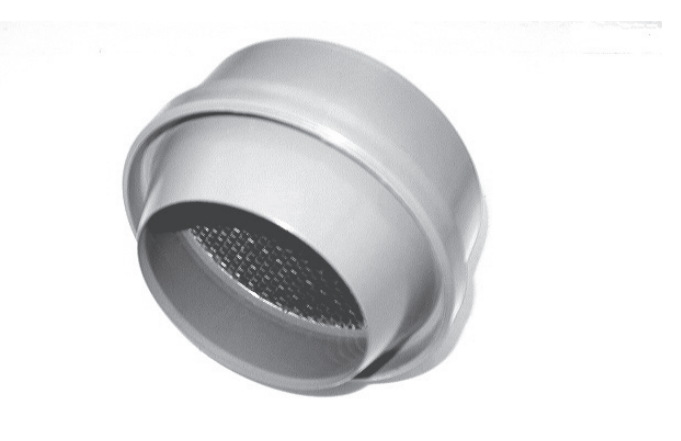
Diesel Power Product's Turbo Air Guide

The turbo air guide, better known as the "TAG," is a controversial item. Many TDR members say they see mileage improvements, better turbo response and lower EGTs when they install this device in front of the turbocharger. Other members see no improvements from stock. For the effect of the TAG compare Test 6 and 8; 17 and 18; and 21 and 24. You be the judge.