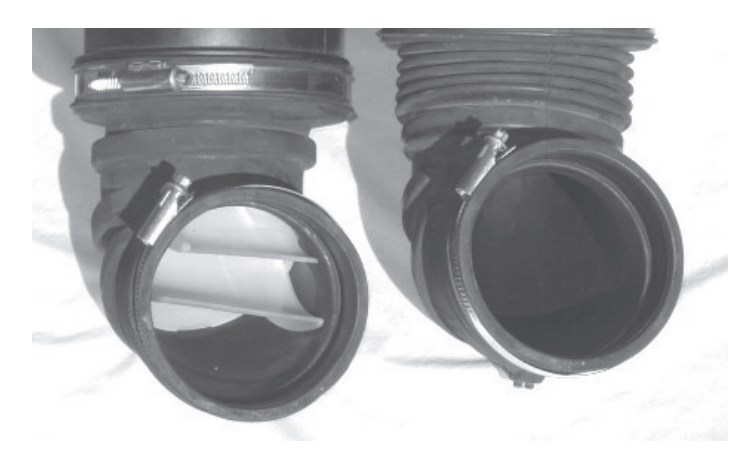
Turning vanes in lower elbow of '05 Stock Intake Tube (Left), Stock '04 Intake Tube elbow (Right)

Is the '04.5-newer intake tube design an improvement over the '03-'04 tube? The answer depends on the engine horsepower level. The '04.5-newer tube uses a longer silencer and plastic turning vanes placed inside the turbo elbow. The '03-'04 tube only has the silencer. At stock power, from Tests 3 and 4, the '04.5-newer intake tube is better than the '04 tube. At the 80 HP fueling level, Tests 13 and 14, show the '04 intake tube is better. However, the definition of better is relative, as in both tests you are looking at a 2.8 or less torque or horsepower number difference.