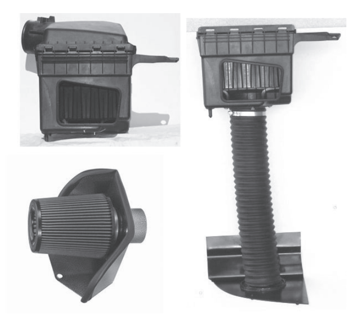
Stock Sealed Air Box (Upper Left), aFe Semi-Heat Shield Air Box (Lower Left), PSM Modified Sealed Stock Air Box (Right)

The three air boxes we tested were the stock '04 unit, a Performance Systems Mfg. (PSM) modified stock air box with an inlet duct running from the bottom of the air box to the underside of the vehicle, and an aFe semi-heatshield type open metal box.