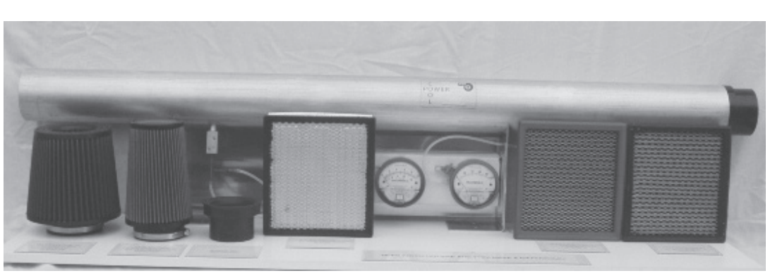
Some of the air filters tested, 2 conical (left), stock paper Mopar (Center), 2 stock replacement gauze (Right)

We do not endorse any of the above filters over any others. There are numerous filter suppliers that offer the same or similar stock replacement filter products that may perform equally well. We simply don't have the time or funds to test them all. The purpose of our tests was to show how filter media affect performance.