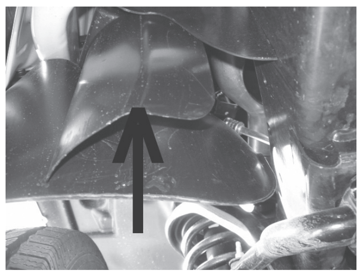
Arrow pointing to vertical baffle used on '04.5 and newer trucks to keep under-hood heated air from entering the air box

The Dodge engineers did a great job of designing the air intake system in our Third Generation trucks.