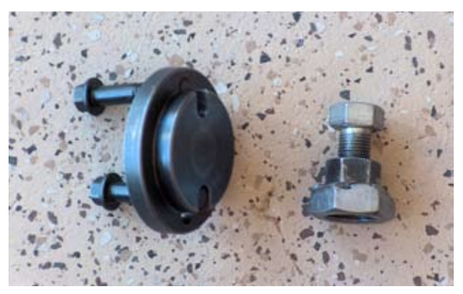
T6. The Snap-on SP504 gear puller with M8x1.25x40 bolts and the home-made pump shaft turning tool at right.

The P7100 injection pump cannot be simply rotated so the top is closer to the cylinder head. Its mounting ears do not have elongated slots, and the back end of this very heavy pump is supported on a flat pedestal mounted to the engine block. You must pull the drive gear and then rotate the pump shaft. Pulling the gear inevitably results in a shock as the taper fit "pops," causing the pump shaft to jump out of time, in the retarded direction—but how much it jumps (rotates) varies with each time it happens. That is why you simply CANNOT use a shadetree trick like popping off the gear, turning the crank a little, and replacing the gear. You just cannot tell where the pump timing "went" without the dial indicator.