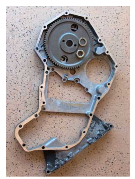
T11. A Cummins B gear housing with a P-pump drive gear, washer, and nut.

5. Use a puller (Snap-on SP504 or similar) to "pop" the gear (photo T11) loose from the tapered pump shaft. If you watch the big and little dials of the indicator, you will see how much the pump timing retarded on this occasion. Use of the puller is illustrated on a CP3 pump and gear in Photo T12. (Notice that the CP3 uses a small 36 tooth gear and thus spins at crankshaft speed, not camshaft speed!)