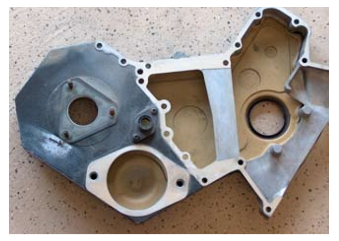
Engine side of a VE-pump style Cummins gear housing.

If you decide to use the "finger clearance" method, first look closely at the pump flange to the outside of the outermost mounting stud and nut. You should find a chisel notch on it, and a corresponding notch in the gear housing. These marks serve to indicate the "factory" timing setting. To rotate the pump and advance the injection timing, you need to loosen the three 13 mm headed nuts and the injector line nuts at the back of the pump (so you won't twist the lines and strain them). The pump will resist turning until the nuts are loose enough, because of the fiber mounting and sealing gasket that can be seen in the photos. The Snapon Blue Point SP144 wrench helps greatly in removing the two hard-to-access pump mounting nuts. The Snap-on flare nut crow's-foot helps to loosen the injector line nuts. It should be 16 mm (5/8", part number FRH200S) or 17 mm (part number FRHM17).