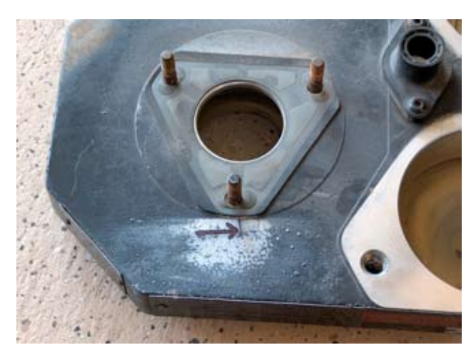
Close up view of the VE pump mounting area of the gear housing with the housing timing mark and the pump-to-housing gasket.