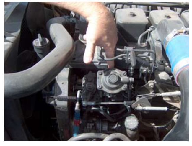
A Bosch VE pump on a Cummins B engine, with a finger showing the clearance between the AFC module and the cylinder head.

finger-width. Advancing the pump too much (moving the top toward the head) gives white smoke, but not the amount of engine fuel knocking or rattling that you would get from advanced timing with an in-line P7100 pump. Better mpg may occur with advancing the VE pump timing slightly from stock. Retarding the pump timing will generally result in lower engine power.