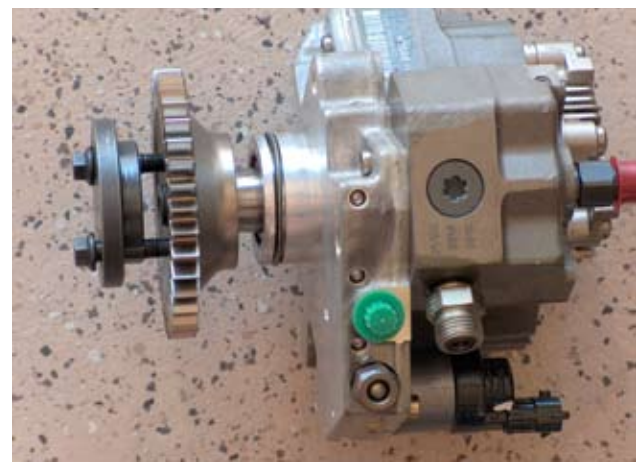
T12. Use of the SP504 gear puller is illustrated here with a Bosch CP3 pump.