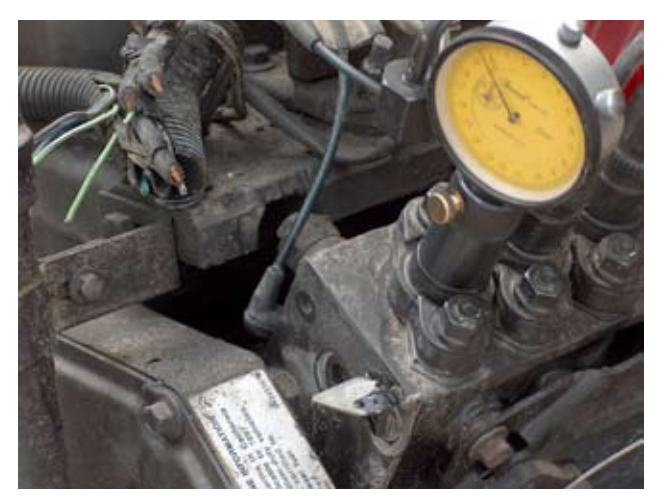
T9. Dial indicator installed in #1 barrel of a P7100 injection pump.