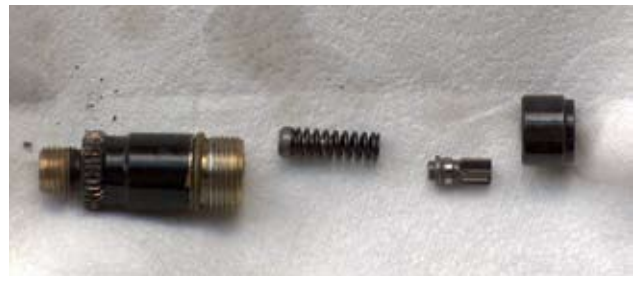
T8. Delivery valve parts removed from #1 injection pump barrel assembly in order to set timing.