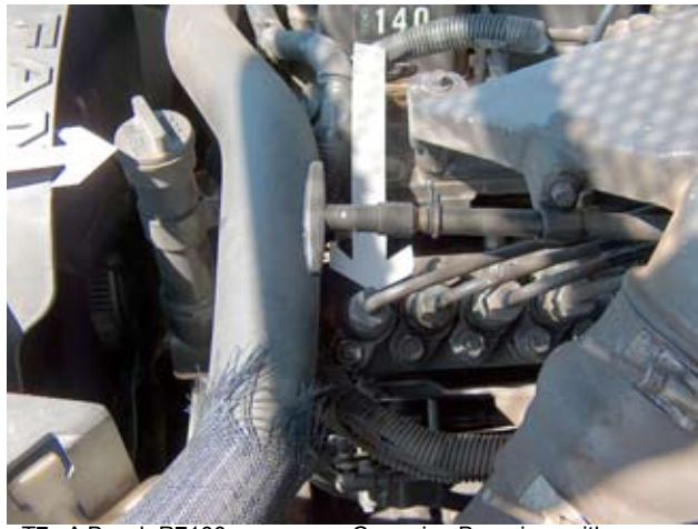
T7. A Bosch P7100 pump on a Cummins B engine, with arrows pointing to the oil filler tube/cap, and to #1 injection line and pump barrel.

Install a dial indicator so you can track the fuel injection event within the pump. Install the engine barring tool in the flywheel and rotate the engine crankshaft until the needle indicates the lowest point of the pump plunger. To get to the plunger, you have to remove #1 injection line, [right hand arrow in photo T7] use a special splined socket to remove the "tower" on the #1 pump barrel, and then use a magnet-on-a-telescoping-stick to pull the delivery valve and its steel casing (about 5/8" diameter) out of the pump barrel. [see photo T8] Then you thread on a special holder for the dial indicator, and install the indicator so the measuring stem is on top of the plunger. [see photo T9]