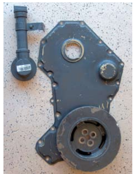
T10. A Cummins gear housing, front side, with the oil filler tube at yop left.