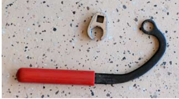
Snap-on flare nut crow's-foot and pump mounting nut wrench.

This article was an update of Joe's Issue 35, page 20-21, article on the Bosch VE fuel injection pump.