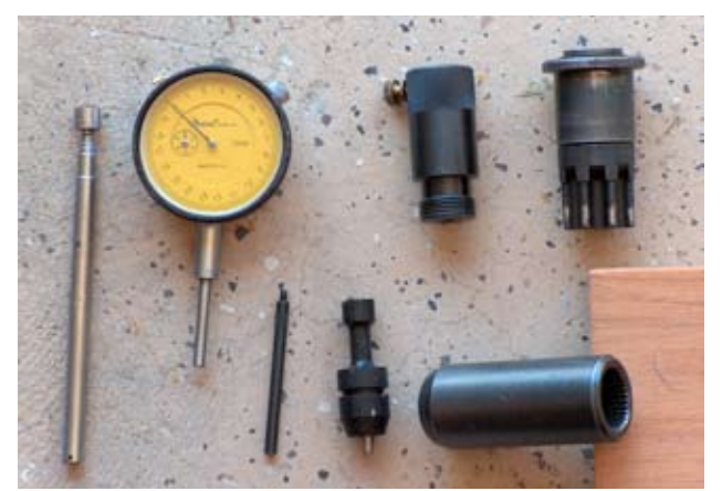
T5. Miller MLR-6860 P7100 pump timing tool kit. At the left is a magnet on a telescoping "stick." To its right is the dial indicator with the stem extension below and to its right. To the right of that is a timing pin with a steel tip epoxy glued onto it. The special splined socket is at bottom right, with the splined end resting on a block of wood. At top center is the adapter that holds the dial indicator and screws into the top of the pump barrel. At top right is an engine barring tool that plugs into the aluminum block adapter plate and meshes with the flywheel teeth.

To set the timing of the P7100 pump, you need precision tools and all fuel system internal parts must be kept scrupulously clean. You need Miller MLR 6860 pump timing tool kit and a Snap-on Blue Point SP504 plate style gear puller (or equivalent). When you remove the #1 delivery valve, do not touch it dry with bare fingers. Use a clean telescoping stalk/ magnet and keep it covered with clean diesel fuel.