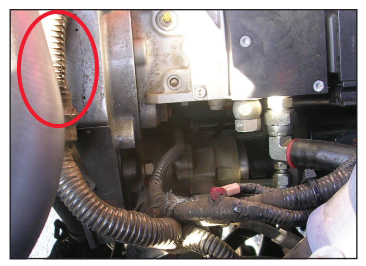
The "Before" picture. The area Don described runs from the alternator across the top/front of the cylinder head (circled area).