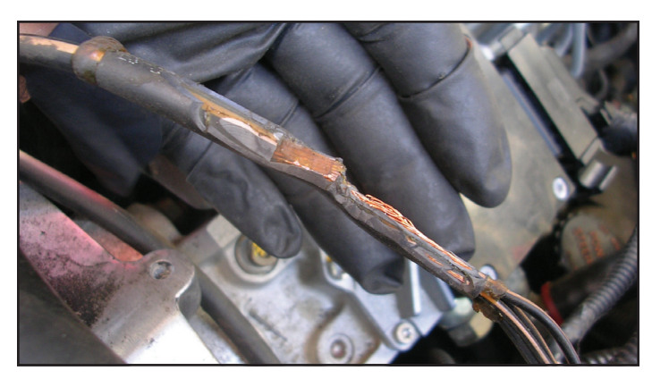
These wires are really secure.

The above picture showed that we really cut into Scott's wiring loom. The actual "four sensor grounds laying on top of the large ground wire" is located just as Don described, forward of the injection pump area. It was easy to spot the wiring junction that Don described. It was not easy to access the wires. While I agree with Don, they are a bundle that is/was heat shrinked together, the bundle is well epoxied, the shrink is epoxied and the wires were air tight. I had to saw sidways through the heat shrink to get down to the wires. The shrink was not "sliceable."