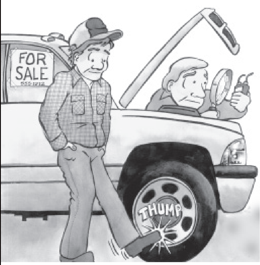
A Publication of the Turbo Diesel Register