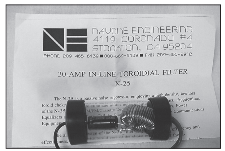
The Navone Engineering N-25 noise filter kit.

A final correction method was provided from a source on the TDR website. I have not tested this fix, but it looks promising. According to the description of the problem and its repair, the noise generated on the TPS signal wire is fed to the ECU, which sends it to the JTEC, which in turn controls torque converter lock/ unlock. This fix consists of installing a filter at the JTEC connector C-1, pin 23, an orange/dark blue wire labeled TPS SENS IN. This wire is cut back from the connector, and the filter kit is soldered in place. The red filter wire is soldered to the cut wire on the connector side. The green filter wire is soldered to the cut wire on the harness side. The black filter wire is spliced and soldered to any one of three ground wires on C-1. All splices are secured by heat shrink and taped. It should be noted that the filter kit is not waterproof. The filter kit, with part number N-25, may be sourced through Navone Engineering, telephone number (209) 465-6139.